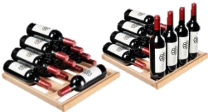
Storage shelf (up to 22 bottles) AXIHW / AXIHB